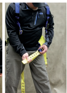
3. Reach between your legs grabbing one leg strap and pull it back through your legs and connect. Repeat this process with the other leg strap. Check to ensure that your leg straps are not twisted, crossed or tangled.

When your leg straps are properly adjusted, you should be able to put two to three fingers between your body and straps.