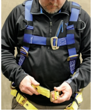
5. If your harness has a belt connection, connect it now. Once you have made all the connections and adjusted your harness for proper fit, you are good to go. It may be necessary to readjust your harness throughout the day.